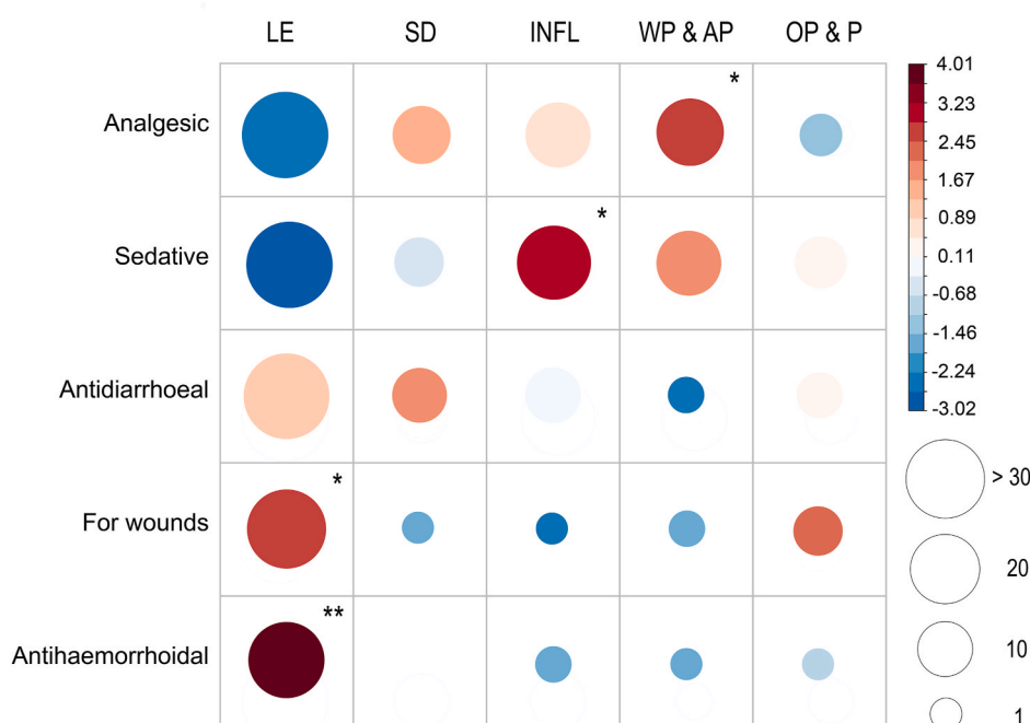
Fig. 3. Frequencies (circle size) and values of adjusted Pearson's chi-square residuals (colour shades) of the plant use for ailments with over 30 data entries. The size of each circle indicates the number of reports for treatment of each ailment depending on the plant part used, while the colour shades indicate values of adjusted Pearson's chi-square residuals. The red colour indicates a positive and the blue a negative association between the plant part used and the ailment treated. Asterisk indicates a significant positive association between the ailments and the plant part used, as calculated with Fischer's exact test (* p < 0.05 and ** p < 0.001 ); LE – leaf, SD – seed, INFL – inflorescence, WP & AP – whole plant and aerial plant parts, OP & P – other plant parts and products (root, resin, twig, branch and shoot, fibre, stem, bark and other parts). (For interpretation of the references to colour in this figure legend, the reader is referred to the Web version of this article.)